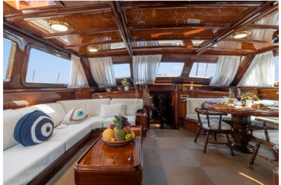
Salon & Dining Area